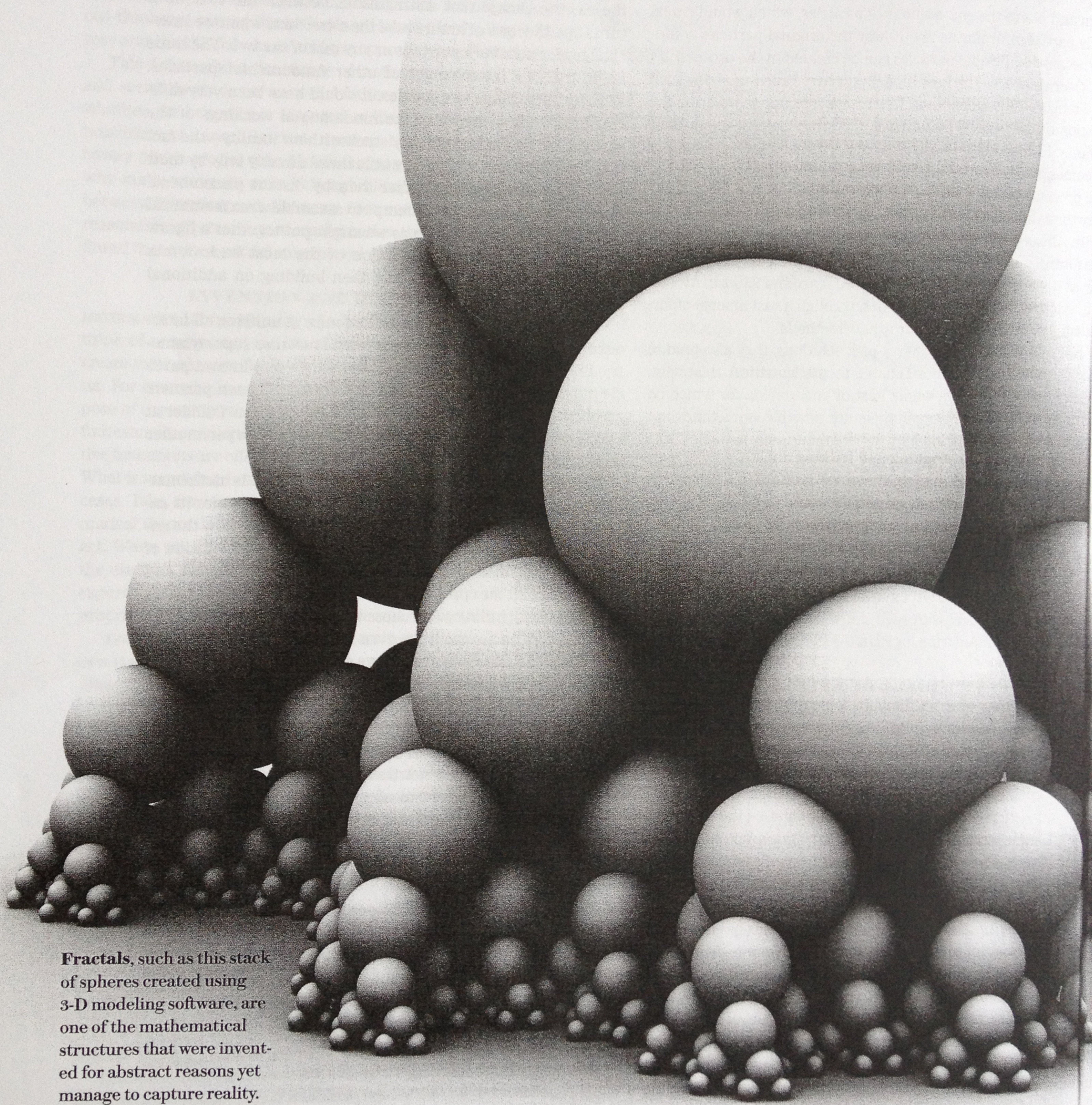
Fractals , such as this stack of spheres created using 3-D modeling software, are one of the mathematical structures that were invented for abstract reasons yet manage to capture reality.